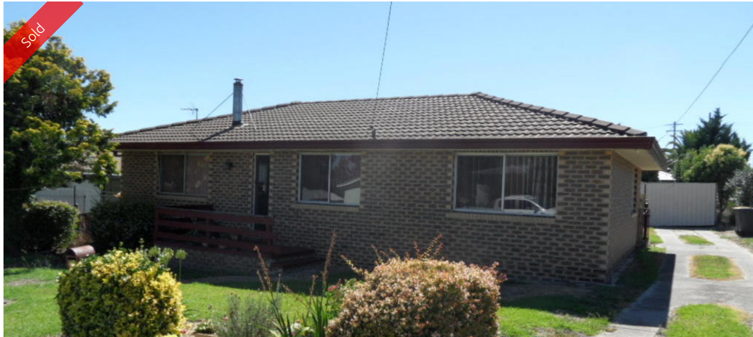
23 Manning St, Stanthorpe