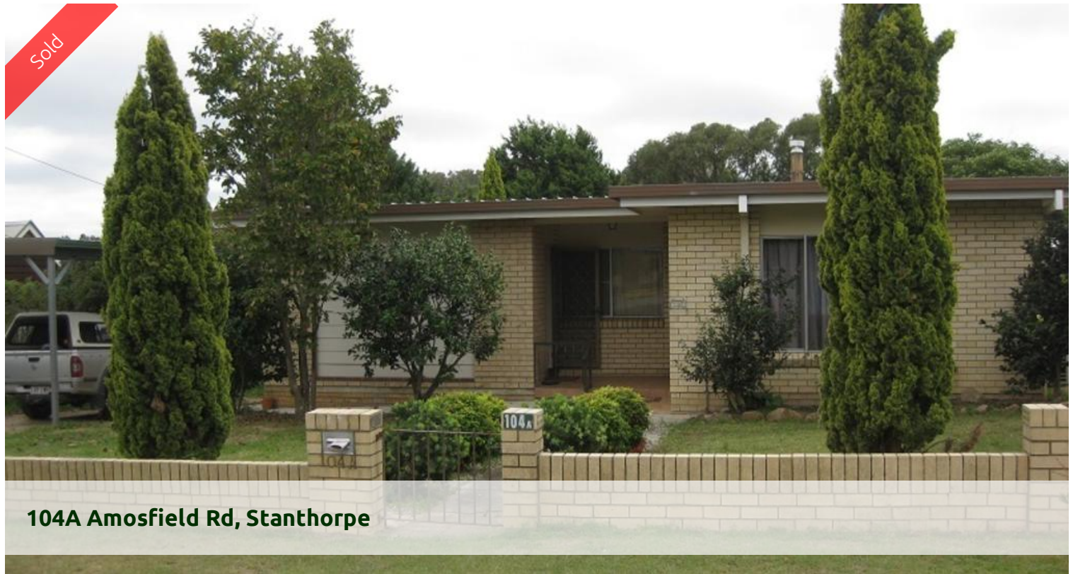
104A Amosfield Rd, Stanthorpe