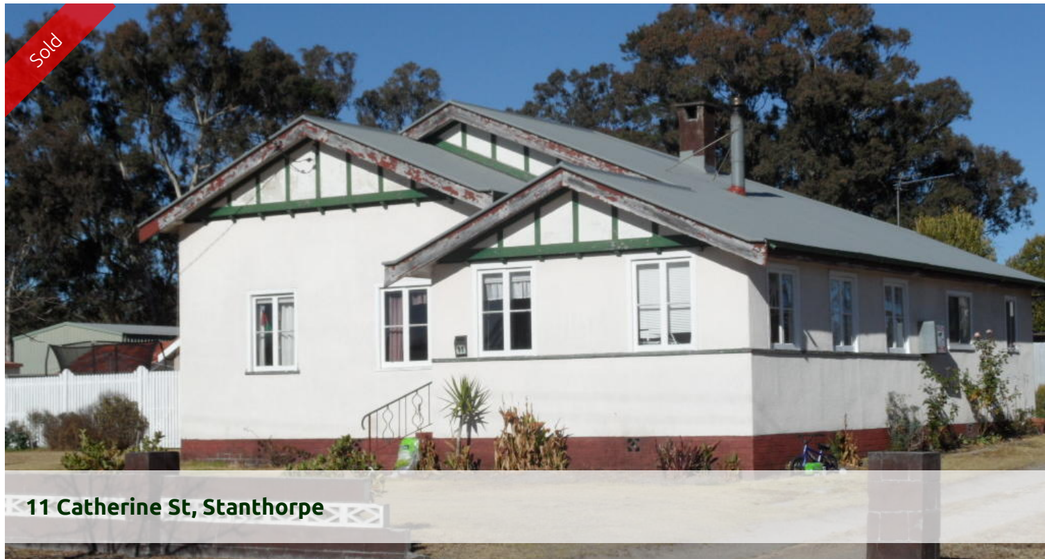
11 Catherine St, Stanthorpe