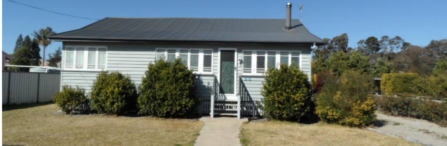
17 Bruhn Lane, Thulimbah